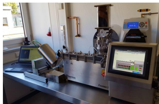
Fig. 1. Set-up for the benchtop twin-screw granulation

corn starch, 5% PVP 30 and 0.2% talcum has been granulated using water. The process parameters total throughput, liquid-to-solid ratio (L/S), screw speed and barrel temperature as well as the screw configuration have been varied independently in this study.